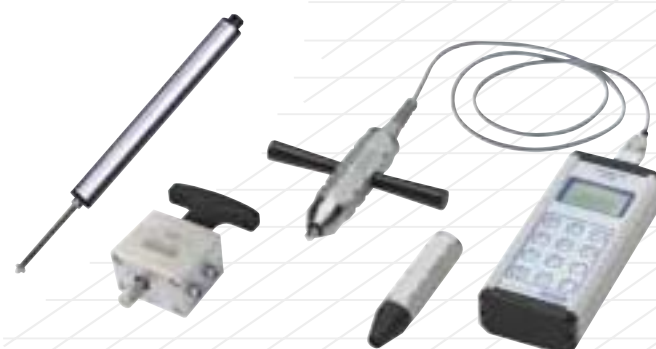
PHYSIMETER® 906 MC

Due to its exceptional flexibility the PHYSIMETER® 906 MC is suitable for a wide range of measuring applications, e.g. using force transducers, torque transducers, displacement transducers, pressure transducers, rotational speed transducers, etc..